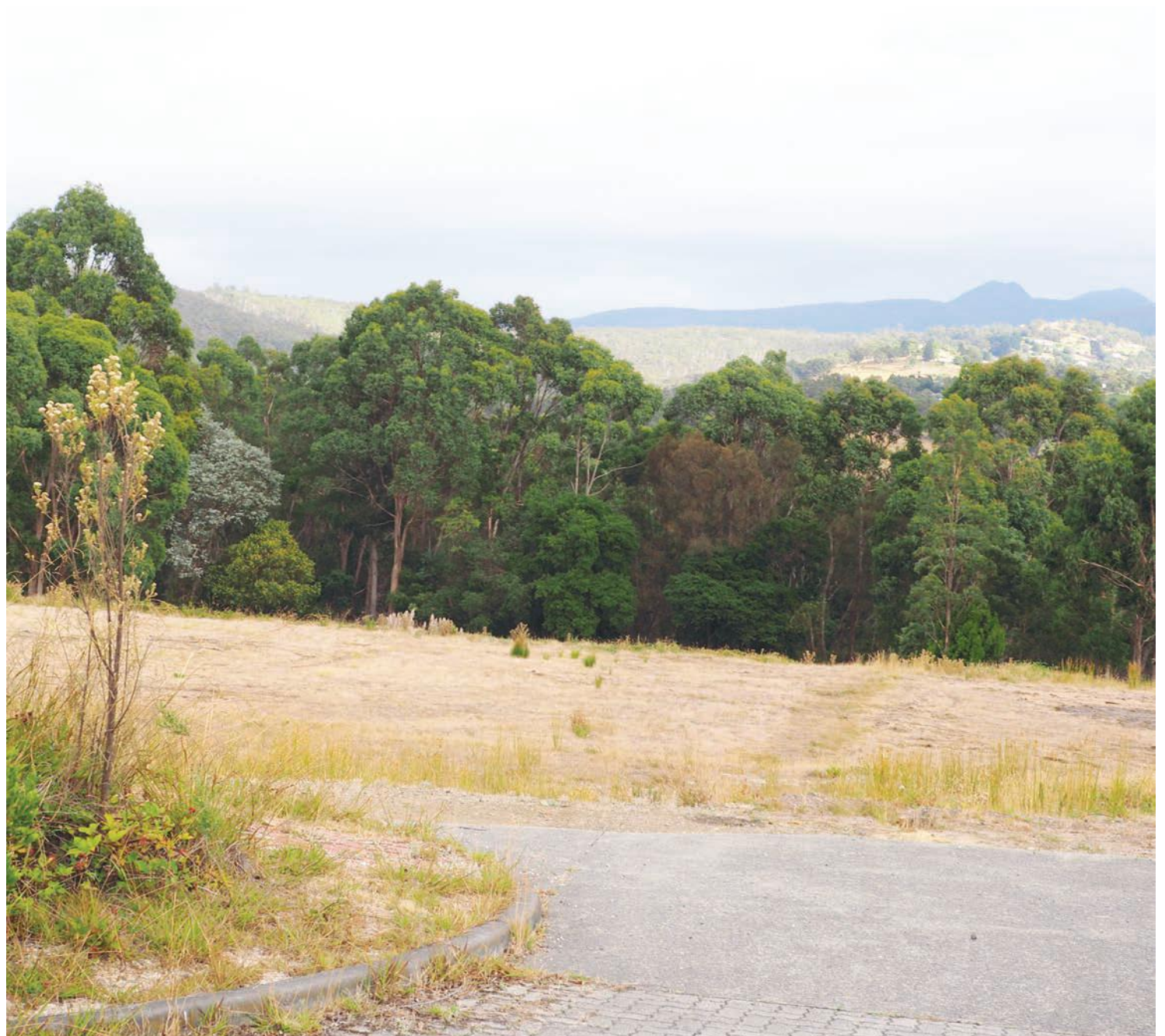
The site on Village Drive where Pinnacle Village will be constructed.